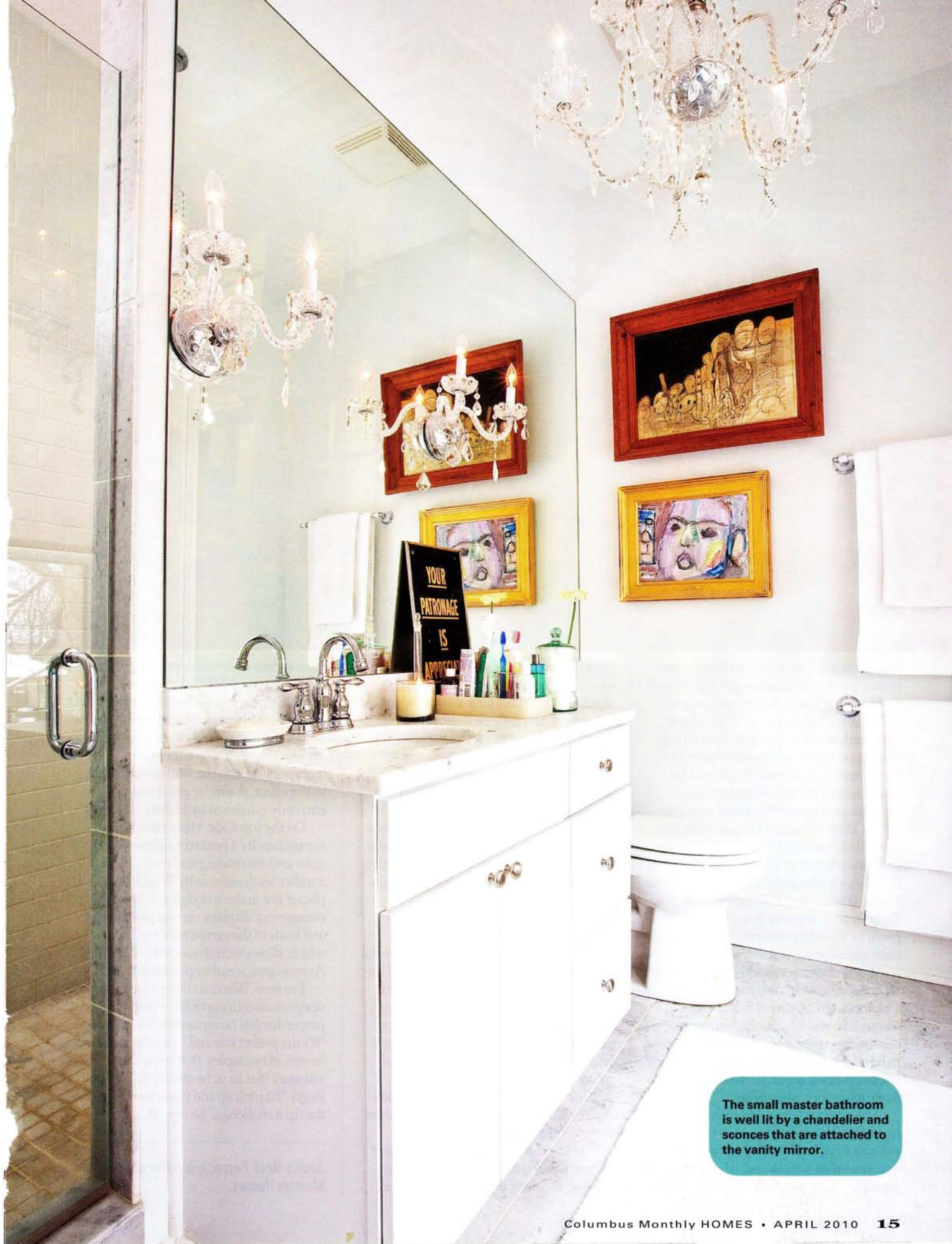
The small master bathroom is well lit by a chandelier and sconces that are attached to the vanity mirror.