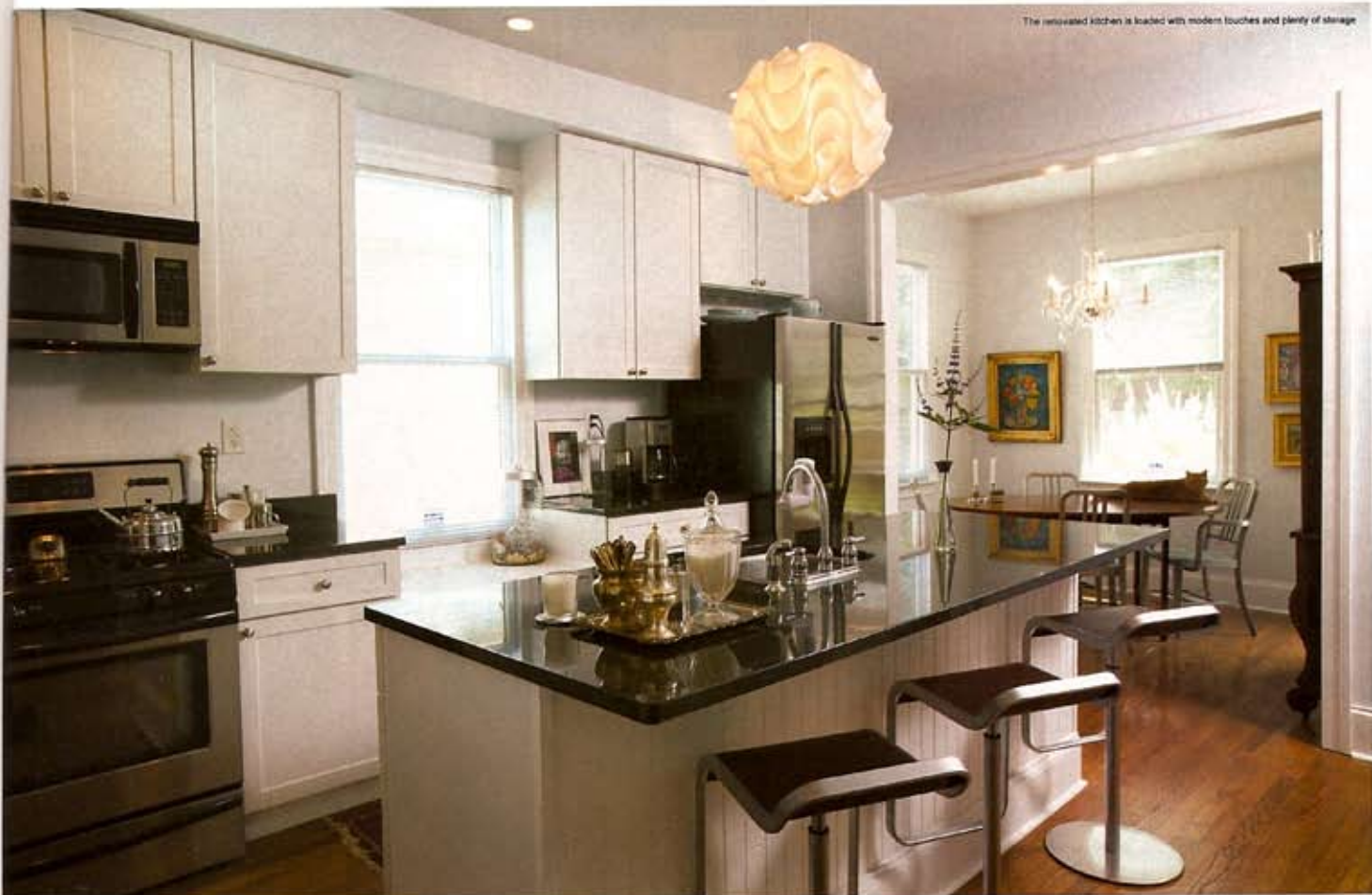
The renovated kitchen is loaded with modern touches and plenty of storage