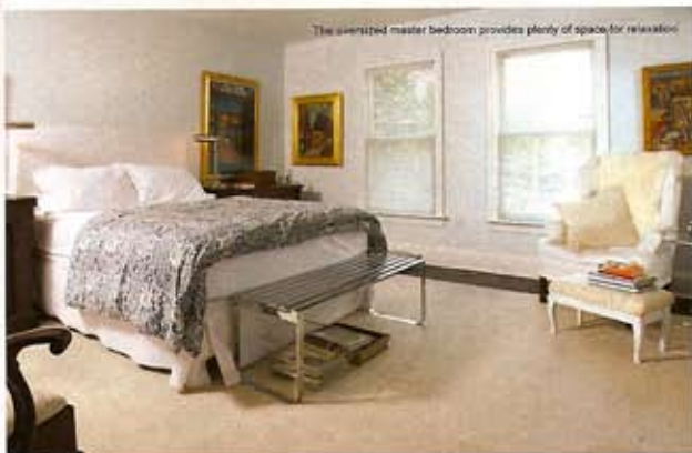
The oversized master bedroom provides plenty of space for relaxation