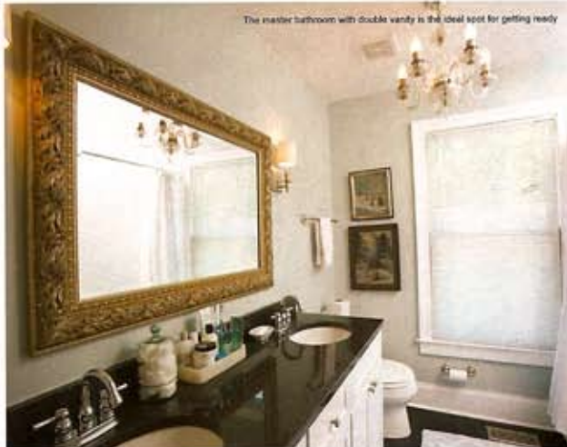
The master bathroom with double vanity is the ideal spot for getting ready

The new addition (which added a dining room and half bath to the first level and a bedroom and full-bath to the second level) then left the owner with a space of roughly 1,400 sq. ft. to decorate and turn into a home. Operating under the mantra that “small is the new big,” the home’s 2 bedroom / 1.5 bath interior was designed to maximize the livable space while still creating plenty of room for storage. Upon entry, you’re immediately in the home’s living room, and are able to admire the new hardwood flooring (which extends into both the kitchen and dining room) and a full wall of custom-made, built-in bookshelves. Creating separation between the living room and kitchen is a decorative, non-working fireplace with marble hearth.